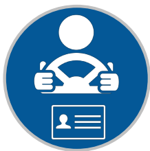
Iowa Driver's License

Acceptable forms of identification include valid