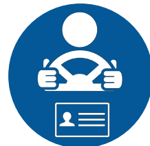
Out of State D.L. AND Proof of Residence 2

Without ID, in 2018, voters may sign an oath verifying their identity. Beginning 2019, no oath will be allowed. In 2018 and 2019 voter's signature will be required and reviewed as part of the ID process.