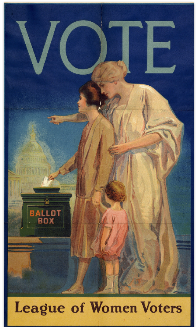
1920 LWV Poster