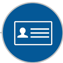
Iowa Non-Operator's ID