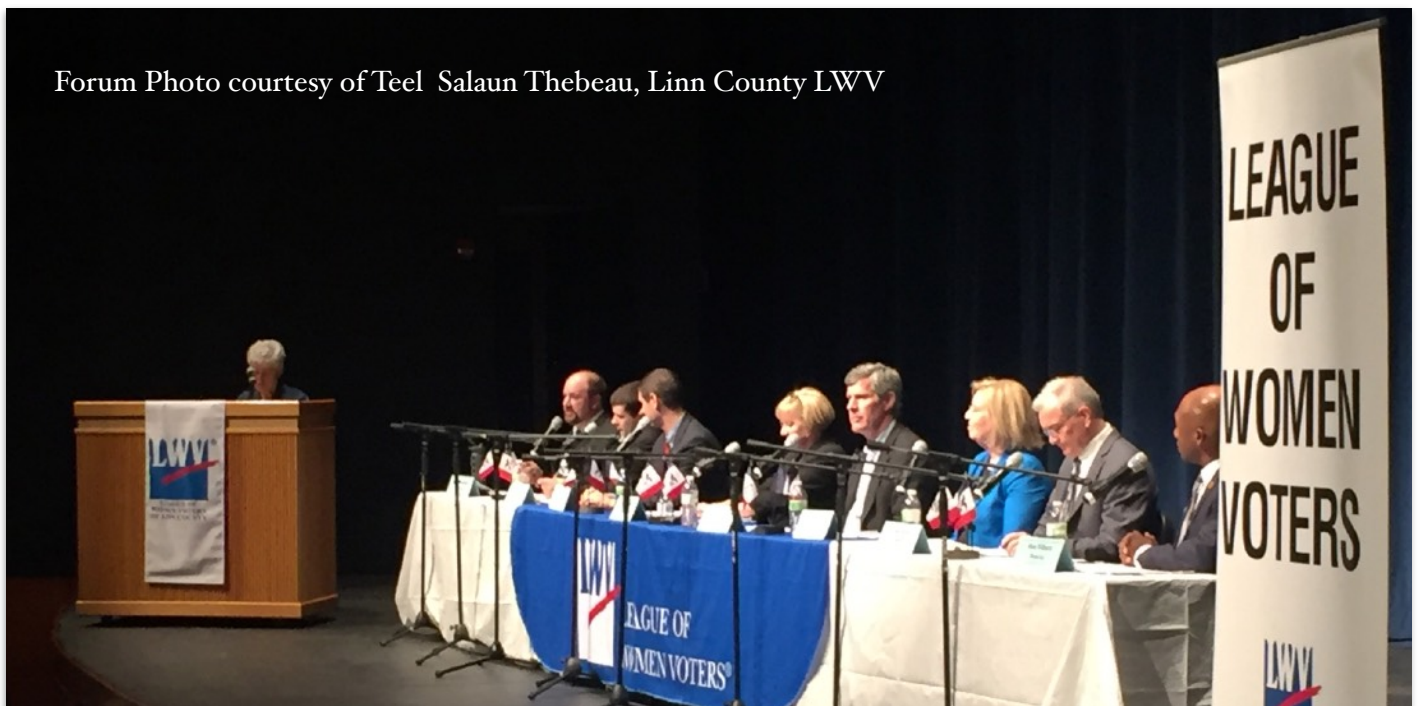
Forum