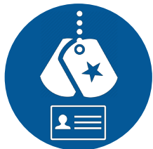
Military or Veterans ID